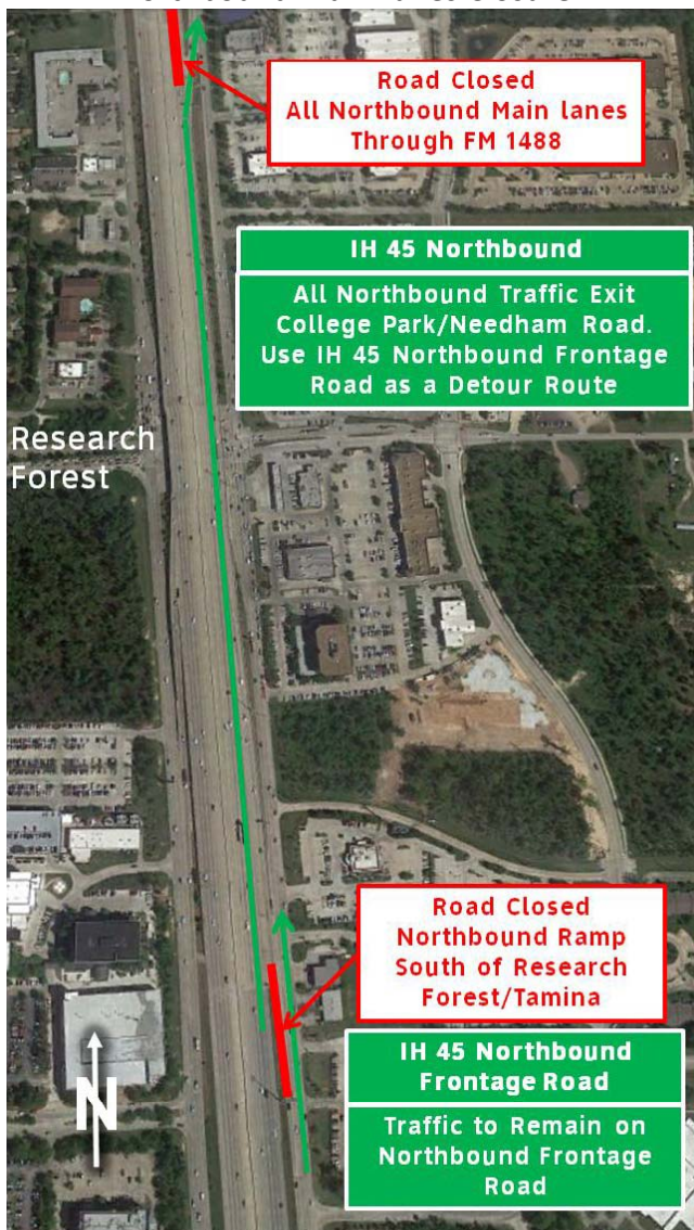
Northbound Main Lanes Closure